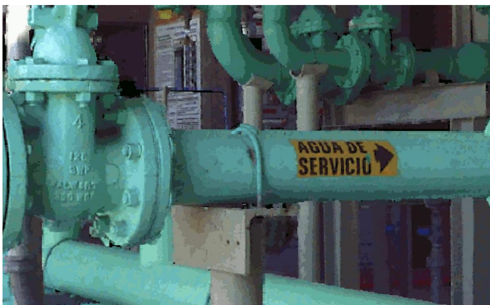
Above: BubbleView from .fls file – LFM Server 5.3.0.1 and earlier

Furthering our continual commitment to improving import routes with AVEVA LFM Server, version 5.4 improves the import of FLS files to ensure areas where there is no laser data are represented within BubbleViews. This is achieved by using the associated colour image rather than being blank. This feature also improves the overall visualisation of the data as shown in the example below. This higher quality is also passed through to AVEVA LFM NetView on AVEVA Connect.