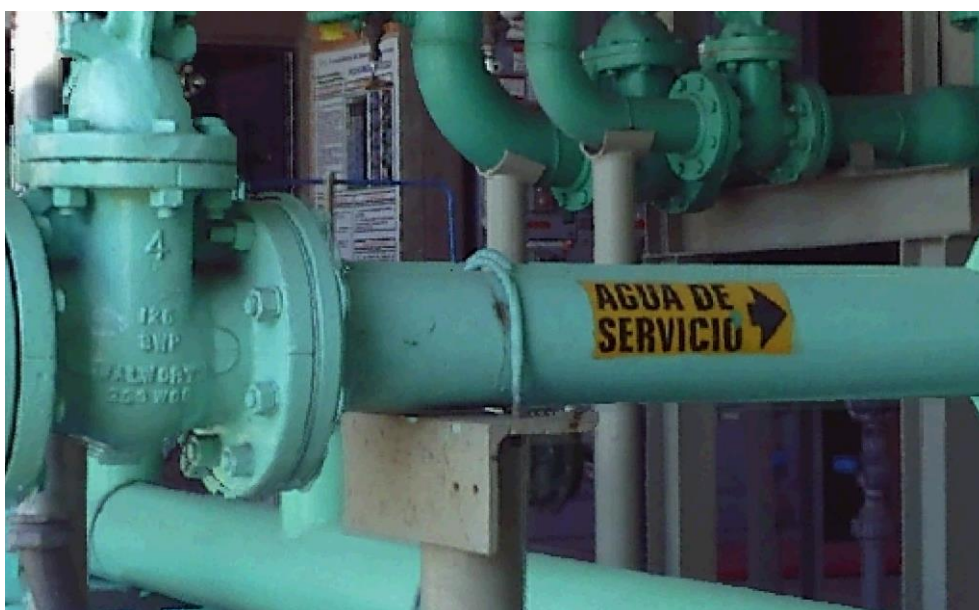
Above: BubbleView from .fls file – LFM Server 5.4.0.3